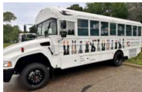
Shoe Away Hunger Bus